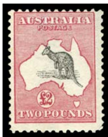
Ex Lot 9