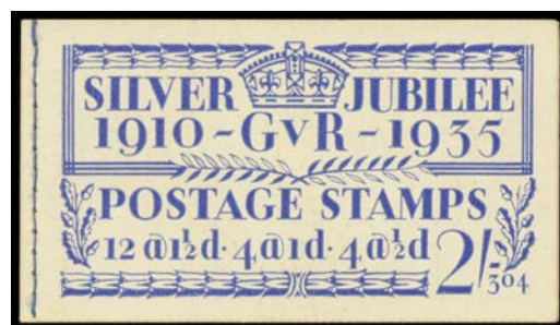
Ex Lot 1105