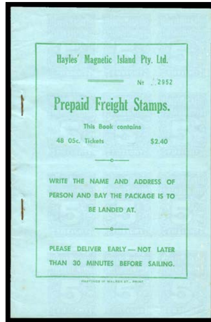
Ex Lot 484