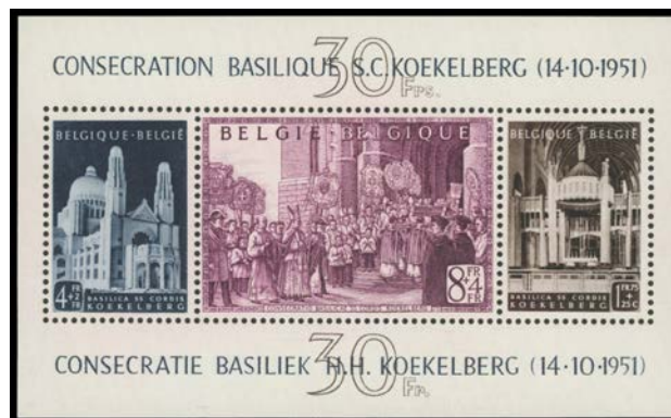
Ex Lot 967