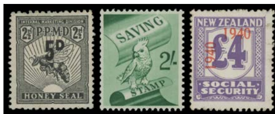
Ex Lot 1301