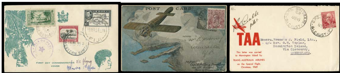
Ex Lot 268