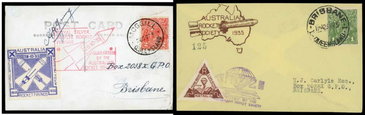
Ex Lot 277