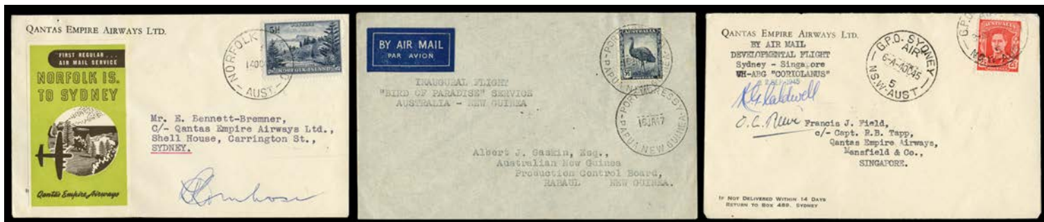
Ex Lot 274