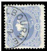
Ex Lot 789

All the material in this section is from the extraordinary collection of Specimen & Reprint Stamps formed by the late Bill McCredie from Sydney & auctioned in Sydney in 2011. The blocks are from a single lot offered in the first Australia Post archival sale in 1987.