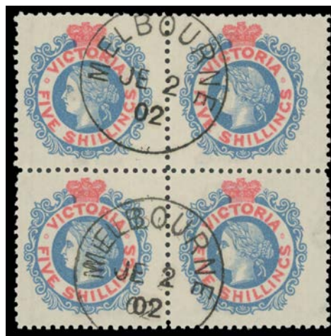
Ex Lot 796

796 ** A+ - Laureates 1d green, 2d violet, 3d orange, 4d rose, 6d blue, 8d orange (light bend), 10d grey, 1/- blue/blue and 5/- rosine (aniline) & blue blocks of 4, full unmounted o.g. Rare & superb multiples. Sold in 2011 for $1955. (9 blocks)