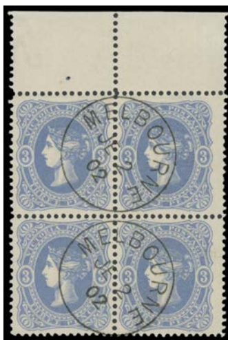
Ex Lot 791

790 Ω A - Half-Lengths 1d, Beaded Ovals 3d blue & 4d, Redrawn 6d, Laureates 1d & 4d, Bell 9d and Naish 1d & 4d all CTO 'JY11/02' and rare thus, no gum. Sold in 2011 for $506. (9) 450