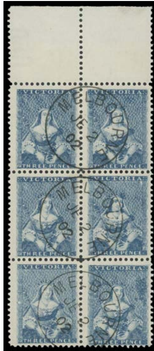
Ex Lot 792

792 **/* A+ - Half-Lengths 1d bright red, 2d brown from the Defaced Plate (3 units lightly mounted) & 3d deep blue marginal blocks of 4 or 6 (the 3d), large-part to full unmounted o.g. Rare & superb multiples. Sold in 2011 for $920. (3 blocks) 750