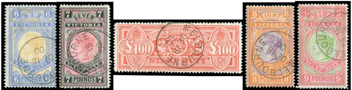
Ex Lot 767