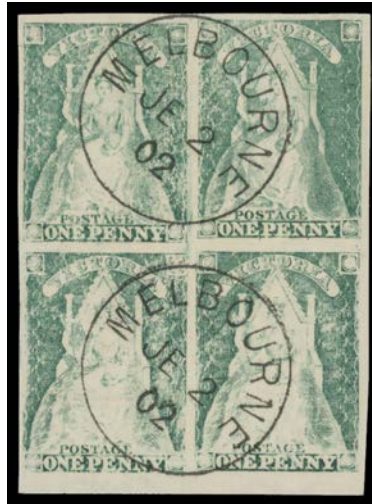
Ex Lot 794

794 */** A - Queen-on-Throne 1d yellow-green (the left-hand units affected by a Pre-Printing Paper Crease ), 1d blue-green (showing how worn the plate was in parts) & 6d dark blue imperf blocks of 4, large-part to full unmounted o.g. Rare multiples. Sold in 2011 for $977. (3 blocks)