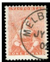
Ex Lot 790

789 ** A+ CANCELLED-TO-ORDER: Mostly perforated array in close to the issued colours including Half-Lengths set, Queen-on-Throne 1d x2 2d & 6d (all imperf), Beaded Ovals 3d blue x2 (one a rare cobalt-blue shade) & 4d, Laureates set to 5/-, Bell set, etc, full unmounted. o.g. Superb! Sold in 2011 for $805. (31) 700