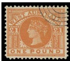
Ex Lot 835

835 V A B1 1902-03 V/Crown 1d to £1 presentation set SG 117-128, all CTO with Concentric Circles, no gum. Very scarce. Ex Bill McCredie : sold at auction in 2011 for $1035, without the 1d. [ NB : the 5d was not issued until 1905] (11)