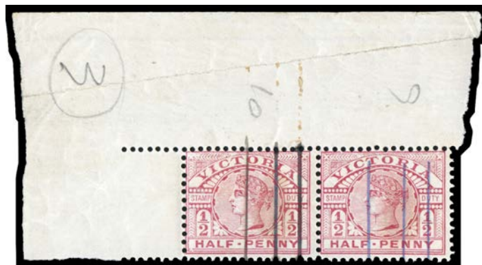
Ex Lot 775