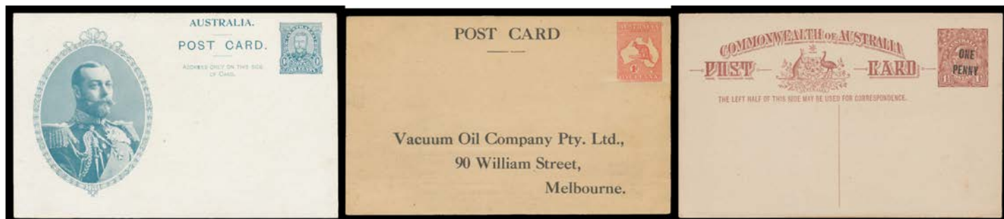
Ex Lot 164