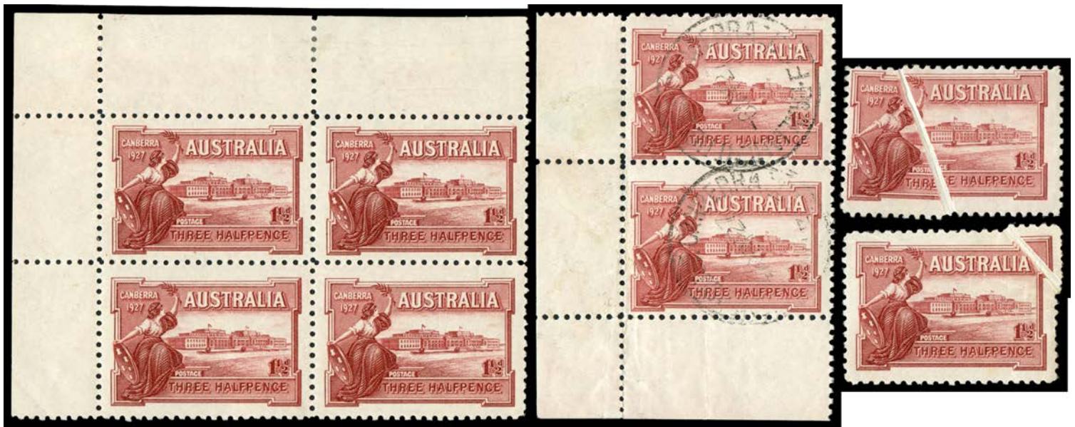
Ex Lot 104

We are pleased to offer the collection formed by Colin Clark-Hutchison from Scotland.