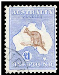
Ex Lot 38

38 F/V A First Wmk £1 brown & blue, CTO with Melbourne cds (no gum); Second Wmk 2/- x2 & 5/-; Third Wmk 1/- with the Watermark Sideways 'used' with non-contemporary cds; Cat $4800 plus the 1/- (5) 1,500