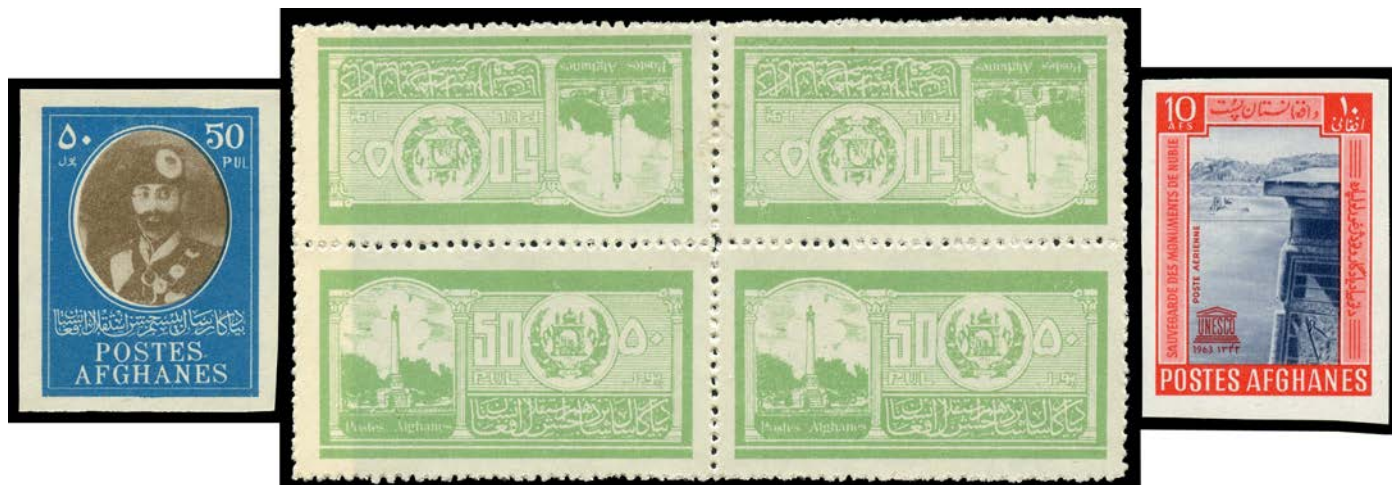
Ex Lot 961