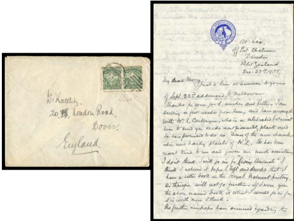
Ex Lot 964