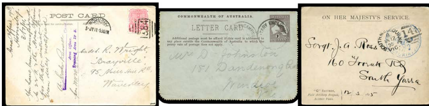
Ex Lot 384