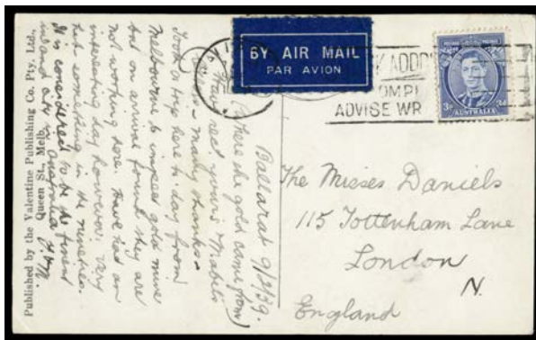
Ex Lot 303

303 C/CL 1938-39 Empire Air Mail Scheme (EAMS) collection with a couple of pre-scheme covers at 1/6d, British 'STAGE 3' pamphlet & leaflet re extension of service to Australasia, first day of service from GB including to New Guinea, New Hebrides, Fiji & Nauru, and from Australia including to Singapore & Ulster, one with huge commemorative cachet in violet, about 20 commercial covers from Australia with various frankings & a rare commercial usage of a PPC at the 3d postcard rate, also a commercial cover from Papua to GB, etc. Ex Neil Russell. [The illustration is above Lot 304] (50+)