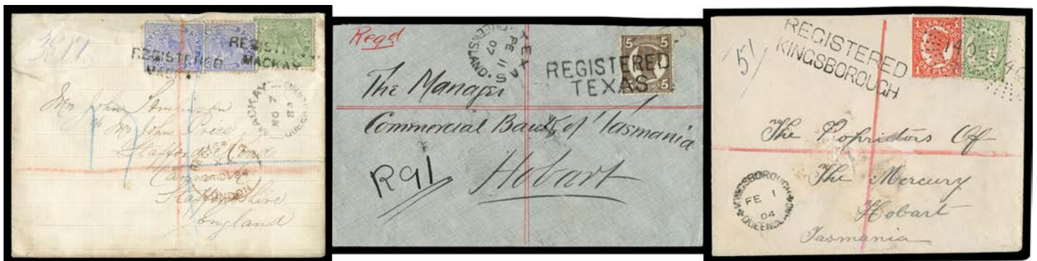
Ex Lot 496