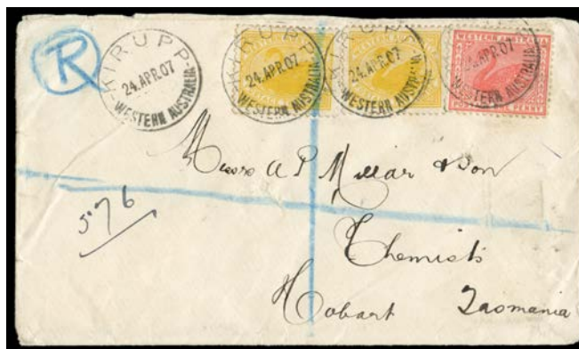
Ex Lot 845