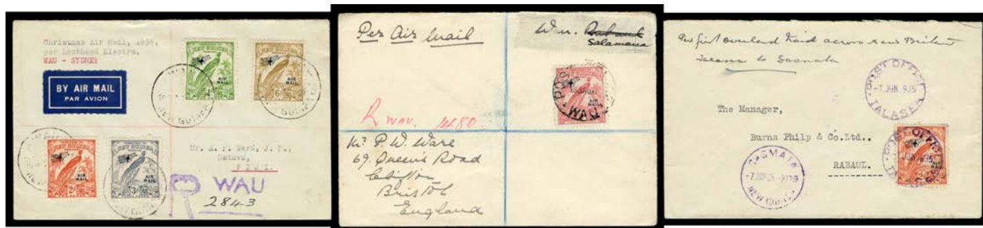
Ex Lot 1265