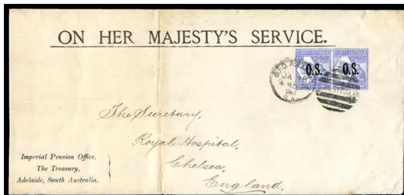
Ex Lot 534