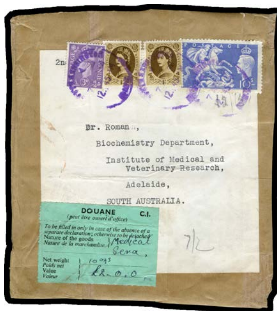
Ex Lot 1114

1114 C/CL Accumulation of 1930s-60s commercial mail never before on the market with much of the post-war material being inwards airmails to Australia, larger covers often with high-value frankings up to KGVI 10/- x3 and QEII Castle 10/- x3, brief inspection reveals 1940-41 'WOMEN'S INTERNMENT CAMP/ISLE-OF-MAN' cachets on cover from Port St. Mary and on postcards from Port Erin x2 (plus card without cachet), 1940 to Holland & 1941 to Greece both with 'NO SERVICE' cachets, other destinations including Japan & Russia, 1954 KGVI 10d solo on airmail newspaper wrappers x2, 1960 Wildings 1/3d with Australia Postage Dues 1d x6, some Regionals & Commemoratives frankings, also official mail, perfins, meter cancels, advertising, stationery, etc, condition mixed but many fine. Weighs 11kg. (many 100s) 500