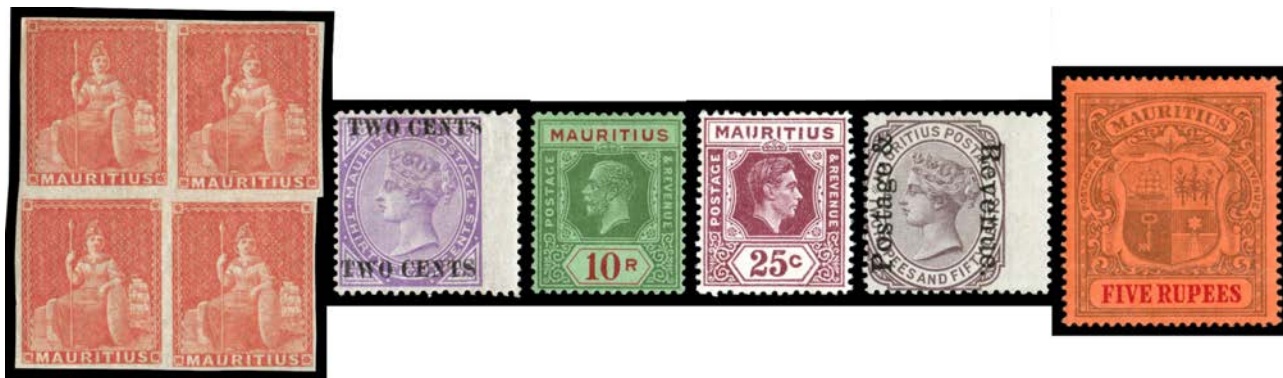
Ex Lot 1130

1130 */** Quality collection with NVI (6d) vermilion block of 4 (**) & (1d) blue U/R corner block of 36 (many units **), 6d purple-slate x2, 1862 6d green imperf plate proof pair (**), 1863 3d dull red pair & 'CANCELLED' 5/- x2, 'One Shilling' on 5/- 'CANCELLED', '38 CENTS' on 9d, CC 4c orange, CA 2c Venetian red block of 4 (**) & 15c chestnut block of 18 (**), 1891 'TWO CENTS' on 38c Double Surcharge SG 121b, 1900-05 Arms set, 'Postage & - Revenue' Overprints set, KGV various to 10r x2, 1925 Surcharges 'Specimen' set, Jubilee 'SPECIMEN' set (**), KGV I - papers not checked by us - with shades to 10r x3 including 25c ' MAIJRITIUS ' Flaw , KGV I Pictorials x2 sets, etc, generally very fine, Cat £4500++. A very appealing lot. (few 100) 2,400