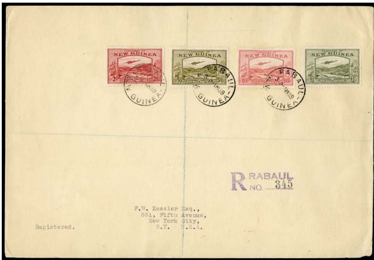
Ex Lot 1273

1273 V A B1 1939 Bulolo Airs ½d to £1 SG 212-225 complete on two large registered covers (256x178mm) to the USA, 'RABAUL' cds & 'R RABAUL/No...' cachets, Cat £850+-. (14) 750 T