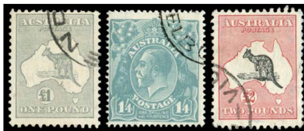
Ex Lot 20