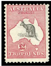
Ex Lot 9