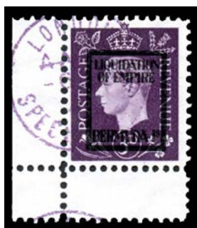
Ex Lot 1083