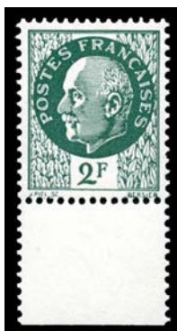
Ex Lot 1071