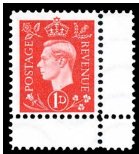
Ex Lot 1082