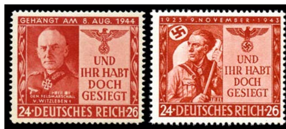
Ex Lot 1079