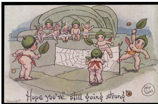
Ex Lot 341

See also World Postcards Lots 924 to 960.