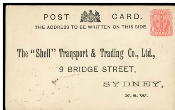
Ex Lot 382