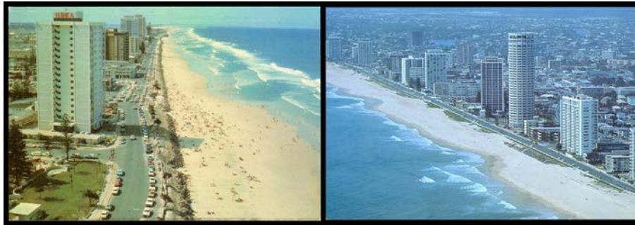
Ex Lot 171

171 PS A+ 1976 Scenic Issue 18c comprising the 16 views that were substituted , nine for relatively minor technical reasons, the other seven - with the "new" versions for comparison - because it was claimed the actual photographs had to be replaced, also two views with Helecon Bars Omitted , unused. Superb! Modern rarities. [Andy Jansen's set sold at the Prestige auction of 7.12.2012 for $2070]