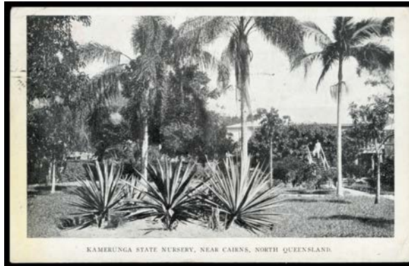
Ex Lot 383

382 PS Postal Stationery selection including scenic Postal Cards from NSW x2, Queensland x2, South Australia x2 & Victoria 1½d Fleet Card, also NSW 1d STO Postal Card for Shell Transport & Trading (rare; minor blemishes), NSW 1½d with printed illustration 'Gruss aus der umgekehrten Welt/...' on the reverse, etc, most unused & generally fine to very fine. (49) 500