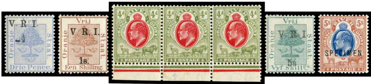
Ex Lot 1001