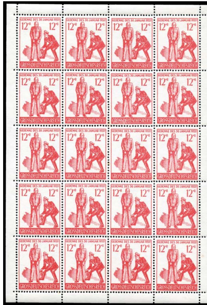
Ex Lot 1080

1080 ** A- PROPAGANDA FORGERIES: Germany 1944 Beer Hall Putsch 12+12pf forgery with inscription altered to '30 JANUAR 1933' - the day Hitler was sworn in as German Chancellor - and central design showing Heinrich Himmler fitting leg-irons to a hand-cuffed civilian Mi 32A, perforated complete sheetlet of 20 (4x5) with margins, a few very minor tone spots, unfolded & unmounted, Cat €16,000. Roland Piele's Certificate (2018). Rare: very few complete sheetlets are known. Produced by Great Britain. (20)