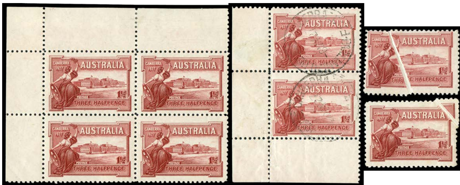
Ex Lot 104

We are pleased to offer the collection formed by Colin Clark-Hutchison from Scotland.