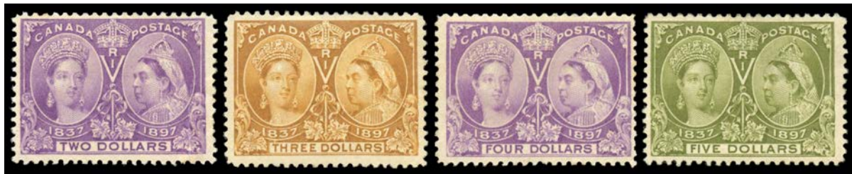
Ex Lot 1966

1966 *Ω A-/B 1897 Diamond Jubilee ½c to $5 complete simplified set SG 121-140, the Dollar values with better than average centring, most with some degree of regumming or redistributed gum, Cat £6000. (16)