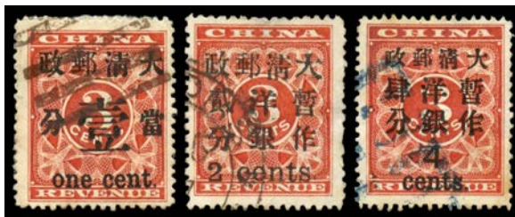
Ex Lot 1970

1970 */O Small group of earlies including 1885-88 Small Dragons 1ca mint and 1ca 3ca & 5ca used, 1894 Dowager with overprints including '10 cents' on 9c green, 1897 Red Revenues overprints 'one cent' '2 cents' & '4/cents', a few later issues to 1950, also Treaty Ports Ichang 1894 set * (3m damaged), Kewkiang 1896 'ONE/1/CENT.' on 15c *, etc, condition mixed but many fine, Cat £2500+ (2012). (96) 400