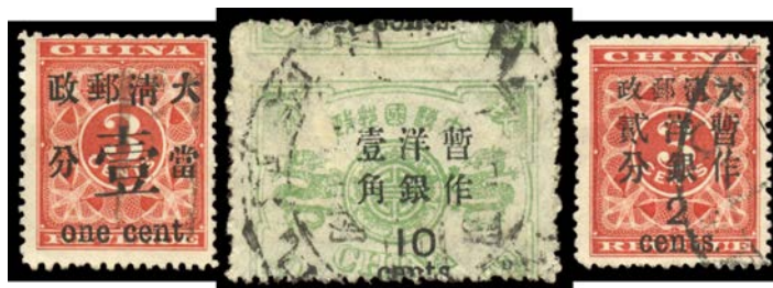
Ex Lot 1971

1970 */O Small group of earlies including 1885-88 Small Dragons 1ca mint and 1ca 3ca & 5ca used, 1894 Dowager with overprints including '10 cents' on 9c green, 1897 Red Revenues overprints 'one cent' '2 cents' & '4/cents', a few later issues to 1950, also Treaty Ports Ichang 1894 set * (3m damaged), Kewkiang 1896 'ONE/1/CENT.' on 15c *, etc, condition mixed but many fine, Cat £2500+ (2012). (96) 400