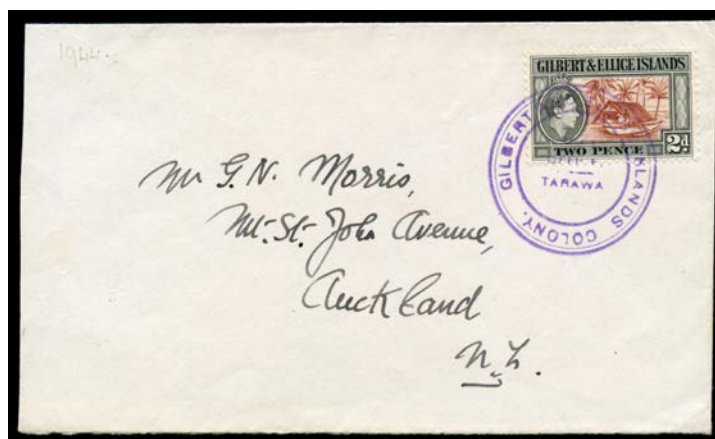
Ex Lot 2013

2013 CPS A/B TARAWA: Batch including two 1917 registered to UK one at correct rate both with red/white 'G & EIP' label, 1944 with largely superb strike of the undated triple-circle 'GILBERT AND ELLICE ISLANDS COLONY/POST/OFFICE/TARAWA' in violet, 1959 with undated rubber 'POST OFFICE TARAWA/("2d")/PAID/GEIC' & 1961 with superb distorted strike, 1966 formular aerogramme from Post Office to UK, generally fine to very fine. (14)