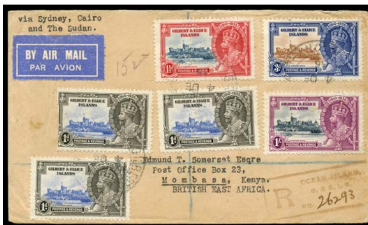
Ex Lot 2004

2004 C A/B 1935 KGV Silver Jubilee frankings from Ocean Island including five registered 1) airmail to Kenya with 1d x3 (one faulty), 1½d, 3d x 2 (one on back) & 1/-; 2) to USA with 1d x3, 1½d x2 & 3d, 'LETTER PACKAGE/COLLECT TEN CENTS' and US 10c Postage Due; 3) OHMS to Southern Rhodesia with 1½d & 3d; 4) to USA with 1d, 1½d & 3d plus KGV ½d and 'Missent to East San Diego, Calif' cachet on face; 5) to USA with 1d x3 & 3d; etc, condition mixed but mostly fine. (9)