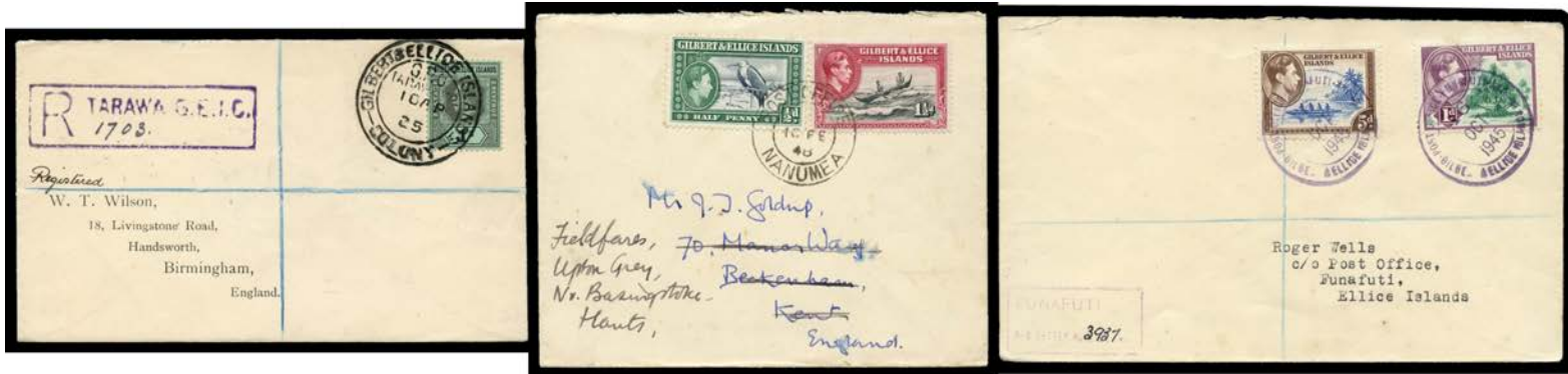
Ex Lot 2001

2001 C A/B Bundle of commercial & mostly philatelic covers including 1917 registered from Tarawa, KGVI Roger Wells registered covers with double-circle cds of Abaiang, Abemama, Aranuka, Arorae, Funafuti (rubber cds), Marakei, Nanumea (commercial, not registered), Nonouti & Vaitupu, useful early-QEII group, also some 1970s flight covers, generally fine to very fine. (43)