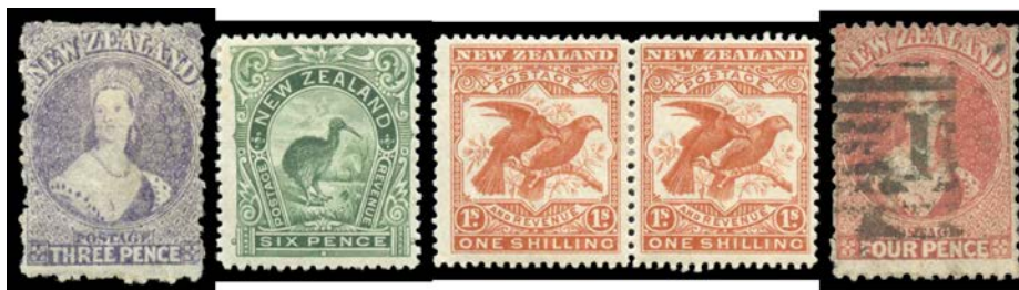
Ex Lot 2089