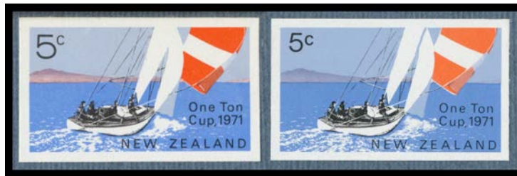
Ex Lot 2095