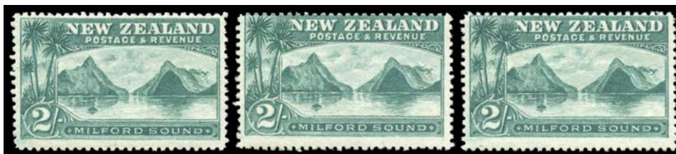
Ex Lot 2088