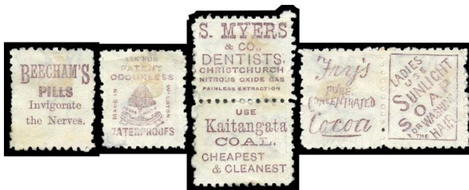
Ex Lot 2092

2092 O A/B 1882-1900 Second Sides Perf 10 8d blue with Advertisements on the Reverse SG 225 comprising seven singles & two pairs with all-different 'Ads-On', some characteristic short/pulled perfs, Cat £770 (NZ$1650). (11)