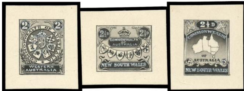
Ex Lot 1071

1071 E A - Original stampsize watercolours for five different designs denominated 2d x2 or 2½d x3 featuring a Map of Australia x2, State Emblems x2 or a Six-Pointed Star, all rendered in black & grey highlighted with Chinese white, variously inscribed 'NEW SOUTH WALES' x2, 'QUEENSLAND', 'TASMANIA' or 'WESTERN/AUSTRALIA' ACSC #E25-29, Cat $20,000! Ex 'Besancon' (II): sold for SFr1210. Truly 'art in miniature!' (10)