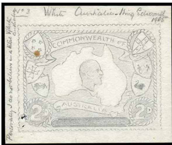
Ex Lot 1068

1068 E B/C 1905 ESSAYS: Three moderately skillful renderings of variations on the theme of KEVII superimposed on a Map of Australia, "No 3" endorsed "White Australia King Edward 1905" & at the side "Personally I do not believe in a total White Australia", "No 1" with a repaired 30mm tear, "No 2" creased at L/R & stained, "No 3" with only minor blemishes. Unrecorded in the ACSC. Ex 'Besancon' (II): sold for SFr605. [Each item is endorsed on the reverse "EHK Crawford/Dryrah/Greenethorpe/NS Wales". Ernest HK Crawford was a grazier & District Justice at Greenethorpe, in the central west of NSW] (3 items)