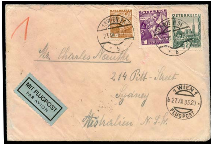
Ex Lot 1872