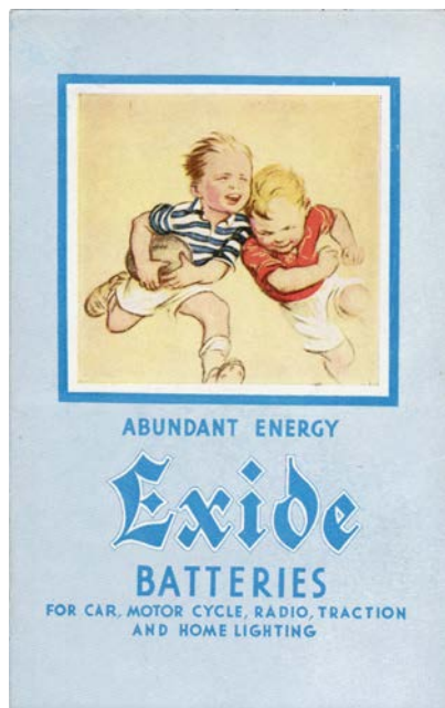
Ex Lot 533