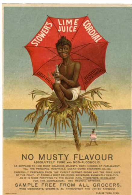
Ex Lot 534