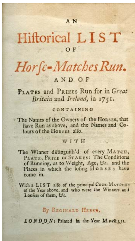
Ex Lot 279