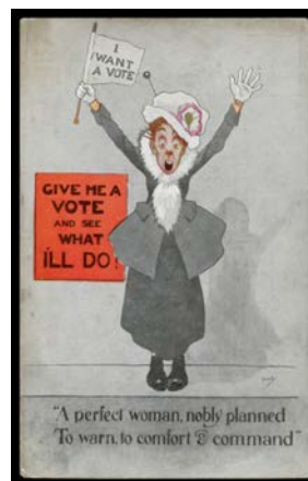
Ex Lot 527

527 C GREAT BRITAIN - ANTI SUFFRAGETTE: Mostly British PPCs by various publishers including ridiculing female domination, hen-pecked husbands, 'fallen women', harem pants, etc, plus a few European types including particularly offensive French & German cards, condition variable but generally fine. (41)