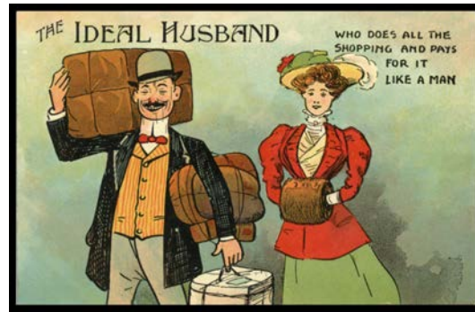
Ex Lot 528

528 C A/B GREAT BRITAIN - ANTI SUFFRAGETTE: National Series postcards 'The Ideal Wife', 'The Ideal Husband' & 'The Bachelor' complete sets of 6, mostly fine to very fine unused. (18)