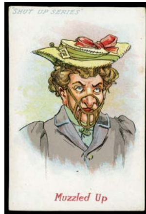
Ex Lot 525

525 C AUSTRALIA - ANTI SUFFRAGETTE OS & P Co 'SHUT UP SERIES' postcards comprising 'Muzzled Up' (damp-spotting on address side), 'Muzzled Up/(In Vain)', 'Sealed Up' all unused & 'Plastered Up' postally used. [Rare Australian edition]. (4)