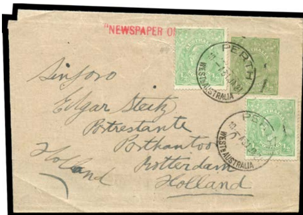
Ex Lot 341