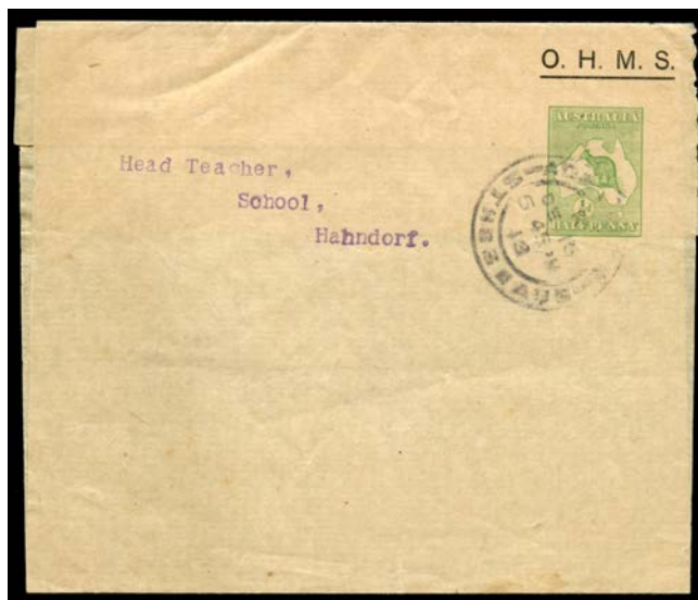
Ex Lot 344