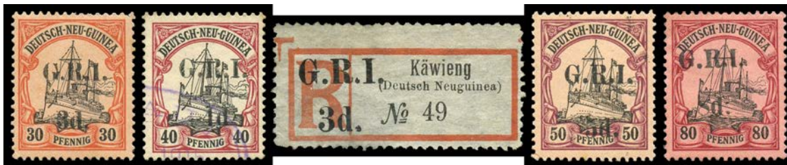
Ex Lot 980

980 *Ω A/A- Selection with DNG simplified set '1d.' on 5pf to '8d.' on 80pf, the 3d on 25pf with a pulled perf, the 4d on 40pf used, also 'OS' duo & 'GRI/3d' on Kawieng/(Deutsch Neuguinea) registration label SG 42 (no gum); Cat £2200 minimum. (13)