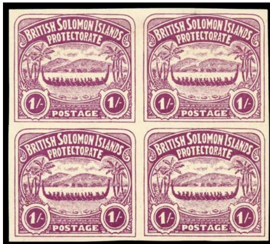
Ex Lot 1158