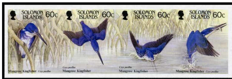
Ex Lot 1166

1165 P A- - die proof for the 2/6d Keyplate only on glazed card with '17MAY12' & 'AFTER/ HARDENING' handstamps, a little rubbed. 250