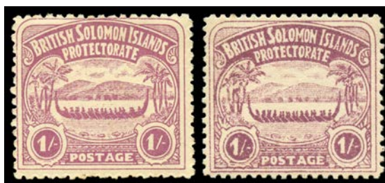
Ex Lot 1159