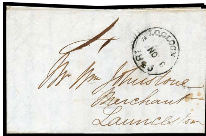
Ex Lot 1995

1995 C A/B 1845-49 Johnstone unpaid local entires with very fine strikes of the '1.O.CLOCK' (double-rate), '4.O.CLOCK' & '10.O.CLOCK' cds. Attractive trio. (3)