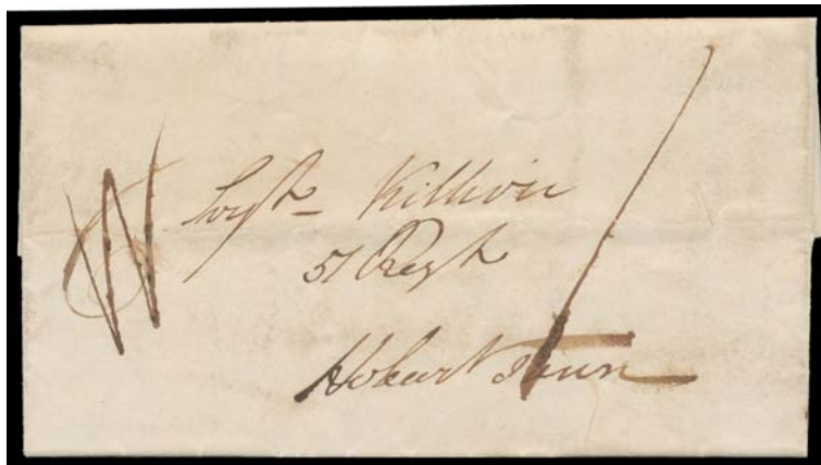
Ex Lot 1991