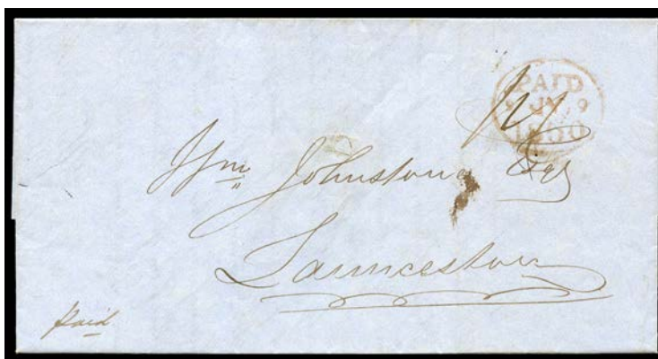
Ex Lot 1990