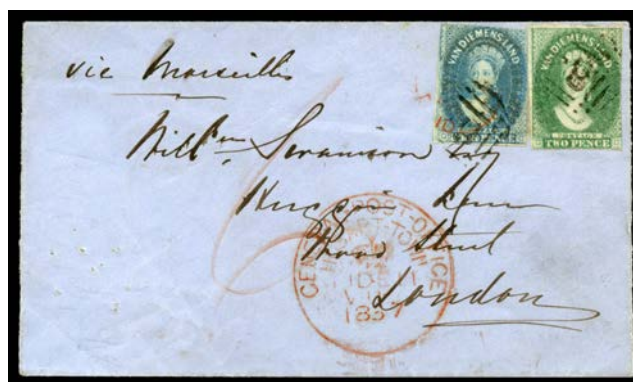
Ex Lot 1983