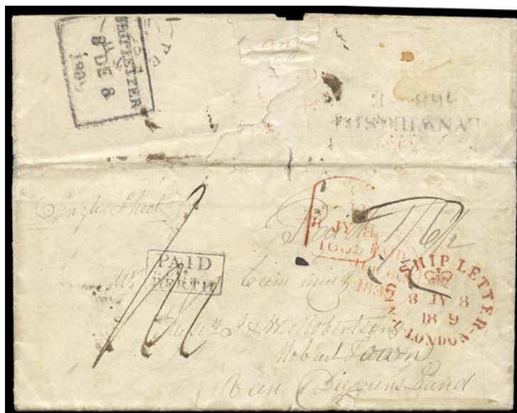
Ex Lot 1992