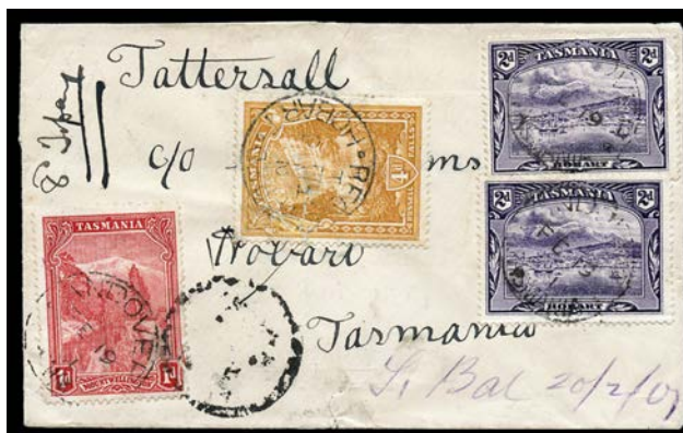
Ex Lot 2014

2013 CPS A/B 1899-1907 all-different OPSO envelopes with printed lines & 'R'-in-Circle or Oval in red, for GPO, Education Department x3 or Treasury x3, the last - soiled - with Pictorials 5d punctured 'T'. (7) 400 T