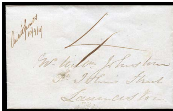
Ex Lot 1996

1996 C 1846-53 internal outers or entires with all-different postmaster's manuscript endorsements from "Antill Ponds" (1847), "Cambelton" ( sic ; 1846), "deloraine" (1853), "George Town" (1847), "Macquarie River" (1853), "P Sorell" (1847) and "Port Sorell" (1853); also "Fingal" on 1859 entire with Chalon 4d; condition variable. (8)