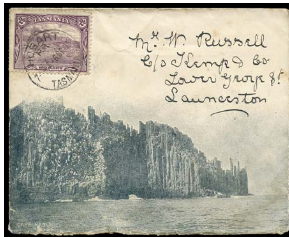
Ex Lot 1982