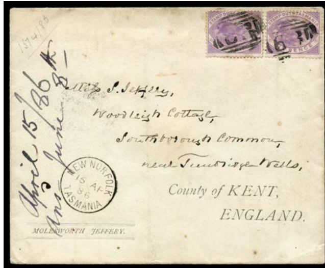
Ex Lot 2007