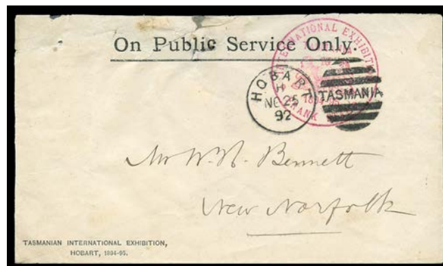
Ex Lot 2012