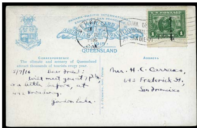
Ex Lot 575

575 C A/B - 1915 Panama-Pacific Exposition (San Francisco) 'semi-official' issues with green frames 'Barron Falls', (abrasion caused when stamp removed), 'Barron Gorge, Cairns Railway', 'Picking Grapes for Market, Roma' & 'View overlooking Woombye...', all used in America two with different Panama California Exposition (San Diego) slogan cancels from Berkeley or San Diego. A rare quartet. (4)