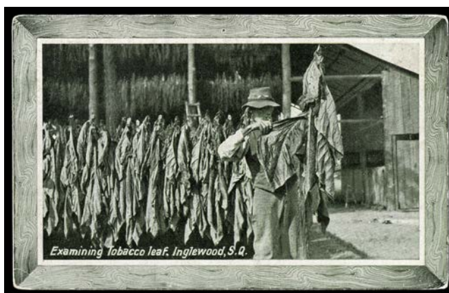
Ex Lot 574

See also World Postcards: Lots 697 to 726.