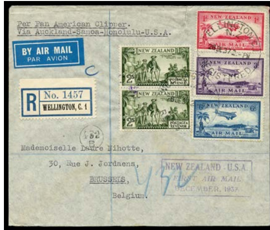
Ex Lot 679

679 C/CL Trans-Pacific per PanAm mostly between USA & New Zealand but including a few intermediates & some scarce commemorative types, noted NZ-Belgium consular cover with boxed 'NEW ZEALAND-USA/FIRST AIR MAIL/DECEMBER 1937' in violet (rare; most were struck in red), a few apparently commercial items including 1945 US Forces cover from 'PAGO PAGO' (soiled & repaired tear), mostly fine to very fine. (38) 400