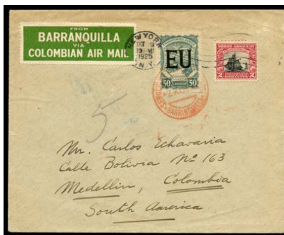
Ex Lot 678