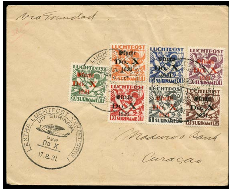
Ex Lot 971