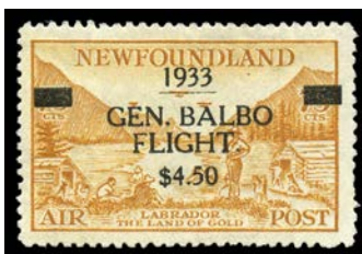
Ex Lot 677