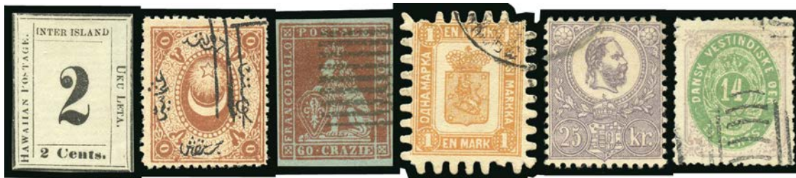
Ex Lot 644

644 ΩO FORGERIES - FOURNIER: Extensive range on pages from Cape of Good Hope, German & Italian States, Hungary, Scandinavia, Spain, Latin America, etc. Excellent reference material. (300 approx)