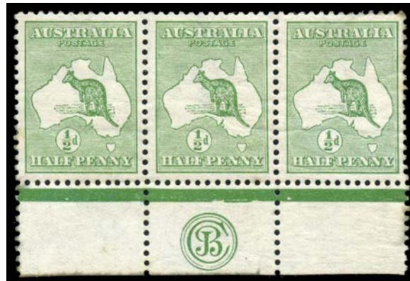
Ex Lot 39

39 **/Ω A/B 1/2d green No Monogram block of 9 from the L/R of the sheet ACSC #1(1)za, guillotined close at the base, unmounted; and with the Watermark Inverted 'JBC' Monogram irregular strip of 3 #1a(2)zd, redistributed gum. [The ACSC states "one JBC monogram piece with watermark inverted exists", Cat $5000. That was Arthur Gray's corner strip of 3 that sold in 2007 for US$4887] (2 items) 500