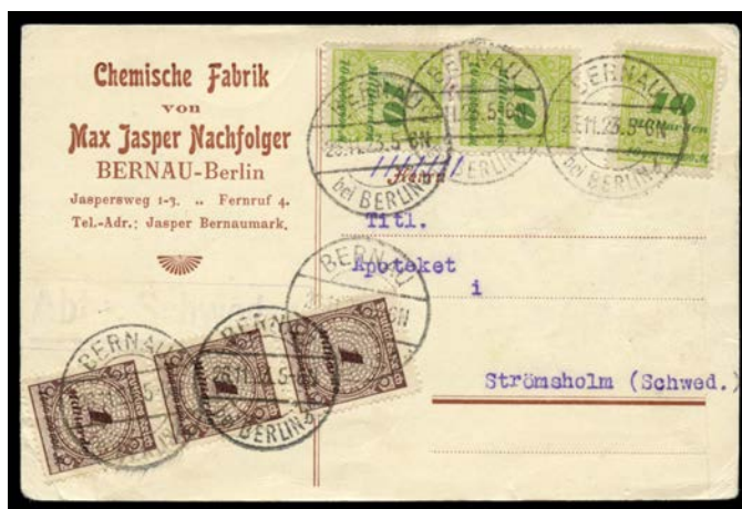
Ex Lot 1195

1194 C B FRENCH COLONIES - SENEGAL: 1899 with Tablet 25c tied by one of two strikes of the octagonal 'BUENOS AYRES A BORDEAUX 1o/LJ No 1' d/s, poor Swedish TPO transit & largely fine 'SUNDSVALL' arrival b/s, minor blemishes. 150 T