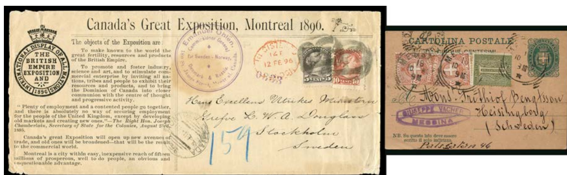
Ex Lot 1189

1189 C/CL The lots in this section are from a collection formed by a European client. Many very scarce origin/destination covers are included.